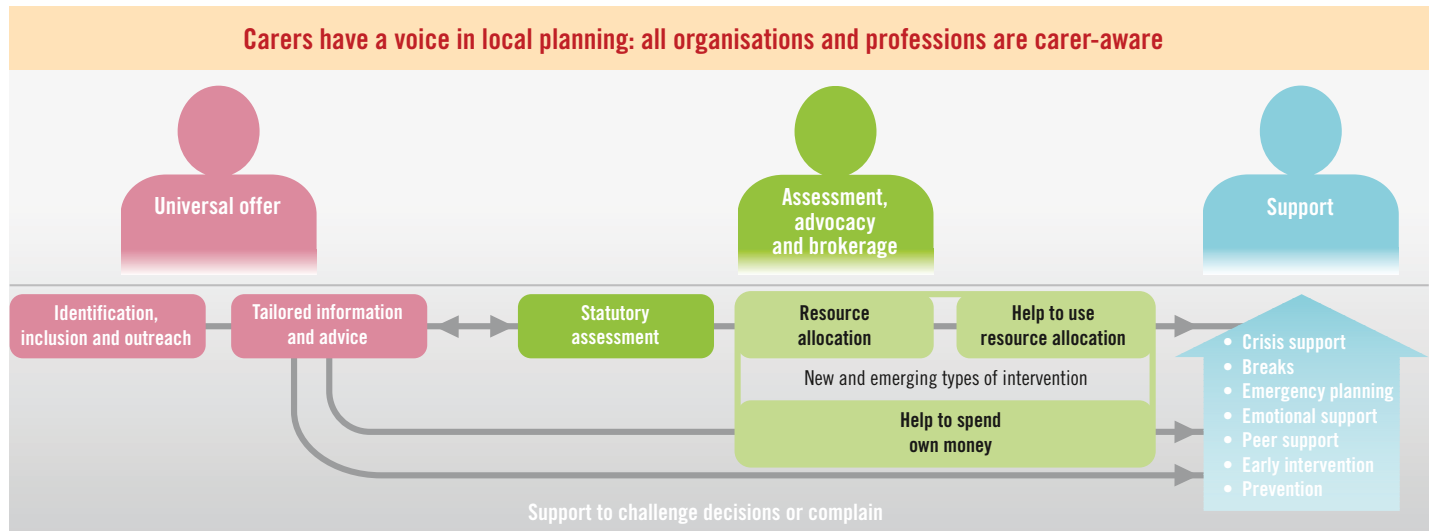
Figure 2: Carers at the heart of communities and services – a care pathway for carer support